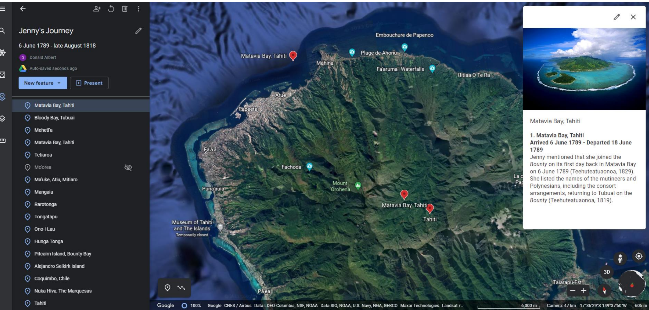
Figure 3. Google Earth’s Project interface showing display functionality: map scale (- or +), direction, perspective (2D or 3D), Street View (bottom right), photo/text box (top right), distance and other tools (far left column), and table of contents (near left column). See Albert 2021b to access the Google Earth Project titled “Jenny’s Journey.” Source: Google Earth, January 17, 2023.