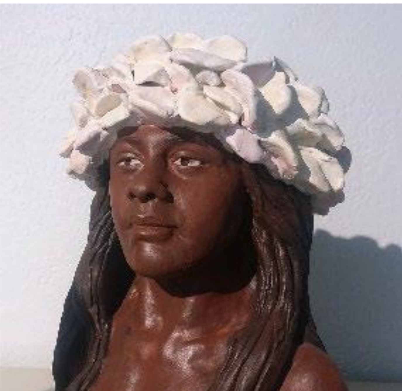
Figure 2. Jenny by sculptor Robert Brown, employing romanticized Western perspective.