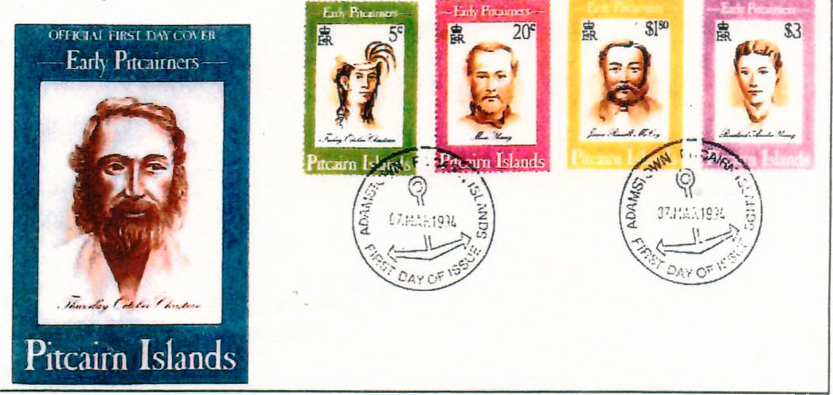
First day cover with Pitcairn stamps honoring Early Pitcairners, including Thursday October Christian.

To read the entire article, go to https://doi.org/10.30958/ajha.7-2-1